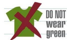
Photo Day: Photo Day is this Wednesday, September 19 . Please do not dress your child in green that day. Families can choose to have a picture taken of all of their children.

Grade 8 Chapel: You are all invited to our Grade 8 chapel next Friday, September 28, beginning at 8:45 in the morning. Refreshments will be served after chapel. Please plan on attending.